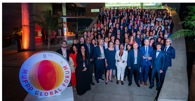
2022, Rio de Janeiro. 8 th Global Forum.

Global Fora are a fundamental moment for the network, an opportunity for our signatory cities to meet, exchange knowledge and practices, participate in technical workshops, share progress and build partnerships. Over the years, the MUFPP Global Fora has become a regular occurrence for cities and key actors in the global urban food agenda. As per tradition, the Global Forum is hosted every time in a different Milan Pact city. In 2022, the city of Rio de Janeiro , Brazil, hosted the 8th MUFPP Global Forum from 17th to 19th October with the theme "Food to Feed the Climate Justice: urban food solutions for a fairer world". Past Global Fora have been hosted in Milan (2015), Rome (2016), Valencia (2017), Tel Aviv (2018), Montpellier (2019), online (2020) and in Barcelona (2021).