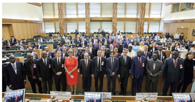
2016, FAO Headquarters. 2 nd Global Forum.