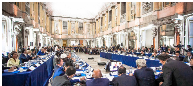
2015, Milan. Signing ceremony of the Milan Urban Food Policy Pact.

The Pact's framework presents a holistic approach towards the food system. A dedicated Monitoring Framework supports cities in better structuring and assessing the impact of their food policies.