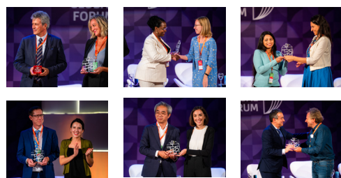
2022 Milan Pact Awards ceremony in Rio de Janeiro

One of the most important goals of the Milan Urban Food Policy Pact is to stimulate the exchange of practices and learning between signatory cities. Therefore, in 2016 the City of Milan and the Cariplo Foundation launched the Milan Pact Awards (MPA) . The aim is to recognize the most creative efforts and monitor cities' improvements since they joined the Pact. Every year the practices submitted are evaluated by an international Evaluation Committee who awards the most innovative practices. Moreover, the Awards are an opportunity to show to international stakeholders the proactivity of the MUFPP cities and their leadership role in shaping food systems. Year after year the Pact gathered 621 practices, creating a unique library of food policies officially approved by city mayors. This library represents the Pact's common knowledge. The increasing participation demonstrates the growing enthusiasm towards food policies and their relevance in the mayoral agenda.